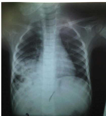
Figure 2: Chest radiograph showing air-filled loops of the bowel in the right hemithorax and a paucity of gas in the abdomen. The right diaphragm is not discernible.