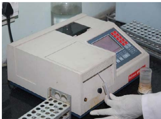
Figure 3: Determination of Salivary LDH enzyme

2, 4-dinitro phenyl hydrazine to give the corresponding phenyl hydrazone, which is determined colorimetrically in an alkaline medium (Figure 3).