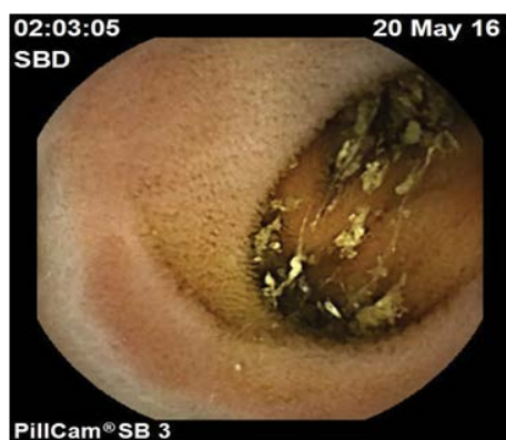
Figure 2: Wireless capsule endoscopy (WCE) images of Meckel's diverticulum.