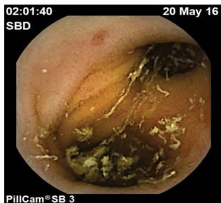
Figure 1: Wireless capsule endoscopy (WCE) images of Meckel's diverticulum.

Colonoscopy showed blood from the upper part of the small intestine. A CT and an angiography were negative. After his second OGIB he was referred for a WCE (Pillcam SB 3). The WCE revealed a Meckel's diverticulum in the distal part of the ileum with inflammatory changes (hyperemia) affecting the nearby area (Figures 1, 2 and 3) and a small insignificant angioectasia. The patient was referred for laparoscopic surgery. A 12 cm Meckel's diverticulum was found at approximately 100 cm above