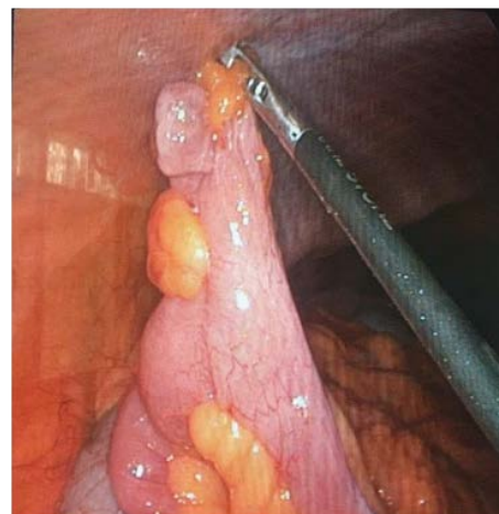
Figure 4: Laparoscopic image of Meckel's diverticulum.

the IC valve (Figure 4). A partial resection of the small bowel with termino-terminal anastomosis was performed. Histopathology confirmed the finding but no ectopic gastric mucosa was found.