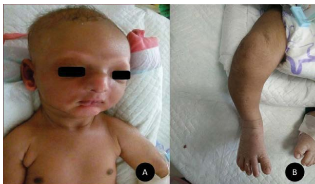
Figure 1. Clinical Photograph of Neonate with Anhidrotic Ectodermal Dysplasia

Skin biopsy report revealed a broad band of orthokeratosis with hypergranulosis of epidermis, loosely packed collagen with scattered nuclei of fibroblasts and many thin walled vessels in the dermis. Most importantly the absence of pilosebaceous units, hair