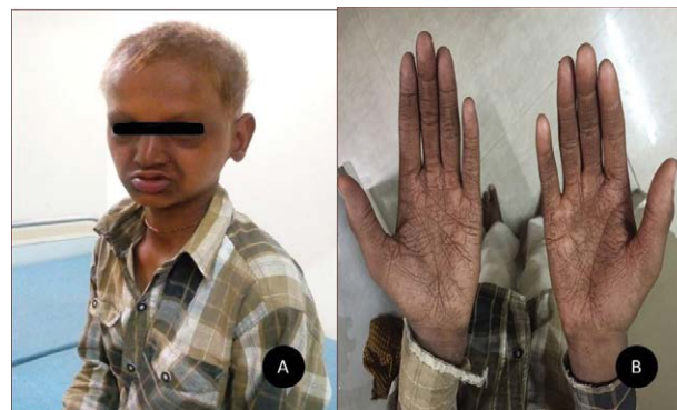
Figure 2. Clinical Photograph of 8 year old Cousin Suffering from Hypohidrotic Ectodermal Dysplasia

[A] Facial photograph of baby showing scanty and light coloured scalp hairs with sparse eyebrows, hyperpigmentation around eyes, thin depressed nasal bridge, prominent forehead, malar hypoplasia, broad rib cage giving appearance of widely spaced nipple. [B] Photograph of lower limbs showing dryness & scaling of skin.